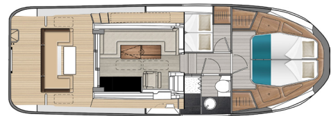
Lower deck - 2 cabins / 1 head